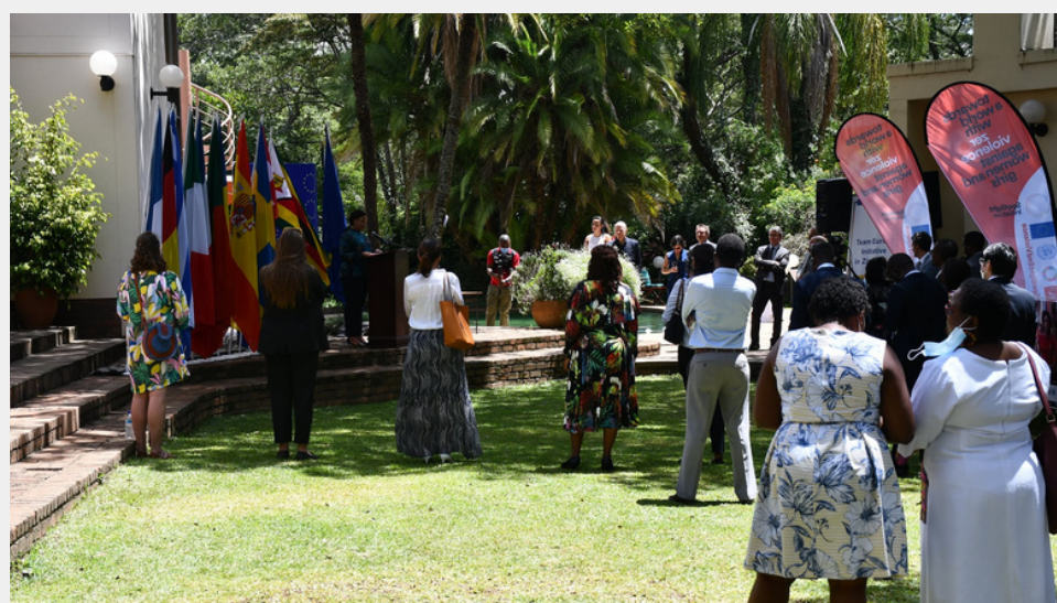
International Women's Day Celebrations at the EU Ambassador's Residence

WLSA joins the rest of the world in commemorating International Women's Day, running under the theme "Gender equality for sustainable tomorrow". Women's day is set aside by the UN to celebrate women's social, economic, cultural and political achievements. During the celebrations, WLSA had a chance to provide free legal aid and showcase its various publications at Harare Gardens, where the main celebrations took place.