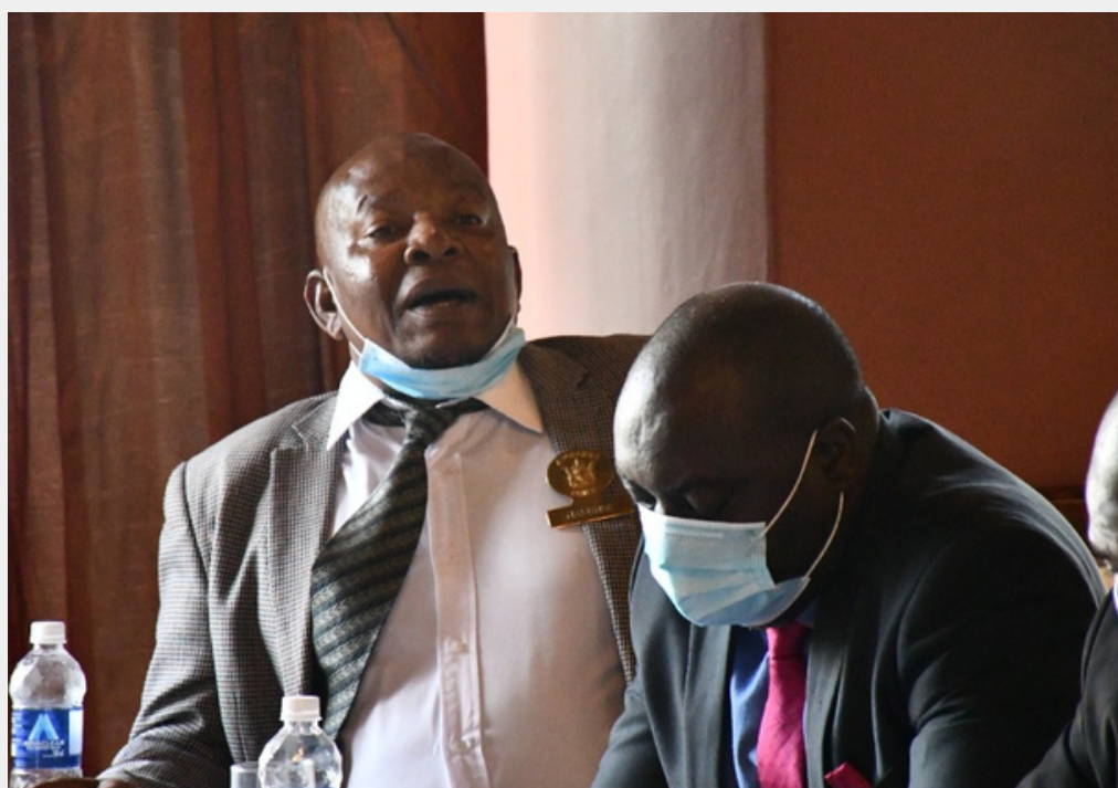
Interactive dialogue with the Chiefs

WLSA held a breakfast meeting with the chiefs council. The purpose of the meeting was of seeking a relationship with the chiefs for more dialogues on their role as traditional leaders in ending harmful cultural practices and GBV. WLSA had an opportunity to present the Traditional leader's act and proposed amendments to strengthen gender equality.