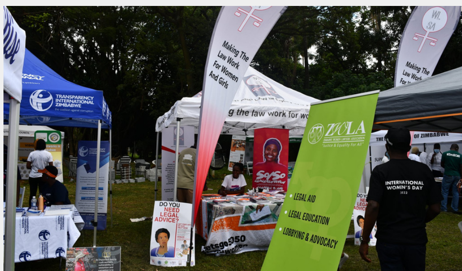
International Women's Day Celebrations at Harare Gardens