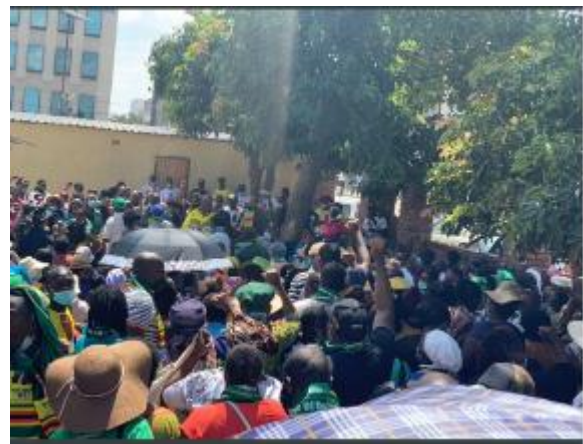
Over 100 people and no social distancing at a ZANU PF party meeting: A potential Covid-19 super spreader event

During the period under review, the ruling ZANU-PF party continued to mobilise its supporters beyond the required or stipulated number of people at public gatherings under Covid-19 level 2 lockdown measures and regulations. For example, the party’s District Coordinating Committee (DCC) meetings have seen participants going above 100 people with no face masks and no social distance among them thereby violating Covid-19 rules and regulations.