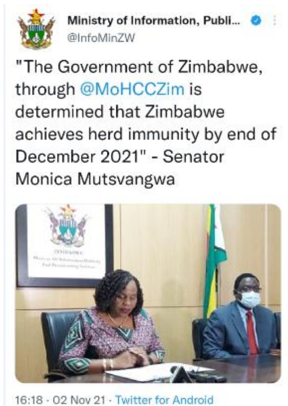
Minister of Information Monica Mutsvangwa addressing the media on Covid-19 herd immunity.