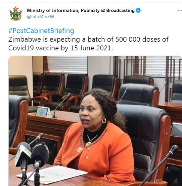
Figure 3: This promise was made on 8 June 2021 but as of 21 June 2021 there was no delivery of the vaccines

During a post-Cabinet briefing on 8 June 2021, Information Minister Monica Mutsvangwa said Zimbabwe was going to receive a batch of 500 000 doses of Covid-19 vaccines by 15 June 2021. However, by 15 June 2021 there was no delivery of these vaccines and no explanation was given by the government.