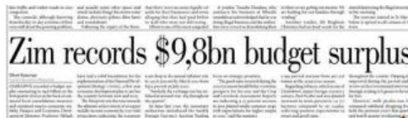
Figure 2: A story in The Herald newspaper saying Zimbabwe records $9.8bn budget surplus

management of public funds be made loud, particularly in the fight against Covid-19 pandemic.