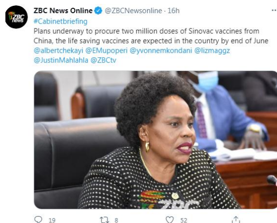
Figure 4: Latest government promise of the procurement of two million doses of Sinovac vaccines from China expected to be delivered in the country by end of June 2021

On top of yet to be fulfilled promise of 500 000 doses, the government on 22 June 2021 during a post-Cabinet briefing made another promise that plans were underway to procure two million doses of Sinovac vaccines from China. It is said the vaccines are expected in the country by end of June 2021. 10