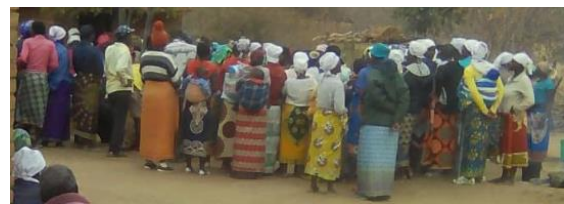
Picture 1: Part of mourners at a funeral wake in Mudzi South Constituency where Physical Distancing was not maintained and face masks were not worn.

to be received. Such behaviour by members of the public is usually exhibited at banking queues, bus terminus, boreholes, and funeral wakes. This week such reports were received from Mpopoma-Pelandaba, Chitungwiza North, Chitungwiza South, Glen View North, Mudzi South, Chipinge East, Guruve South, Goromonzi South, Marondera East, Murewa North, Murewa West, Masvingo North, Mwenezi East, and Nkayi South Constituencies.