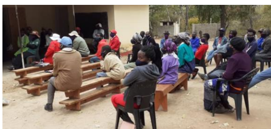
Picture 2: Part of the residents of Ward 31 in Masvingo Central who attended the CCJP COVID-19 awareness meeting.

Efforts of Government and other non-state actors to raise awareness of covid-19 prevention are appreciated. This week a report of such efforts was received from Masvingo Central observer who reported that the Catholic Commission for Justice and Peace (CCJP) held an awareness raising workshop in ward 31 of Masvingo Central Constituency.