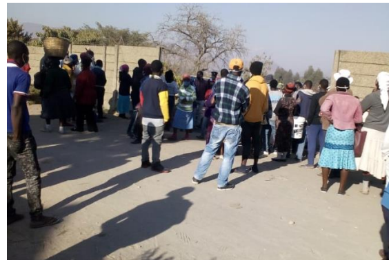
Picture 1: Residents who arrived after 07:30 hours at the fresh produce market at Chikanga 2 sports field being denied access. (Dangamvura-Chikanga Constituency).

Access to vegetable (farmers) markets in Dangamvura-Chikanga remains restricted. The main vegetable markets in the Constituency are required by the Municipal police to operate for only three hours daily, from 06:00 hours to 11:00 hours.