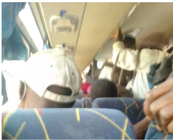
Picture 2: Overloaded ZUPCO bus plying the Manhenga to Bindura town route in Bindura Central Constituency)

Musikavanhu, Kuwadzana East, Highfield East, Glen View North, Luveve, Mudzi North, Mudzi West, Wedza South, Chivi Central, Chivi South, and Mwenezi West indicate that most people were congregating at water distribution points, church gatherings, shopping complexes and not maintaining social distance and the majority were not wearing masks.