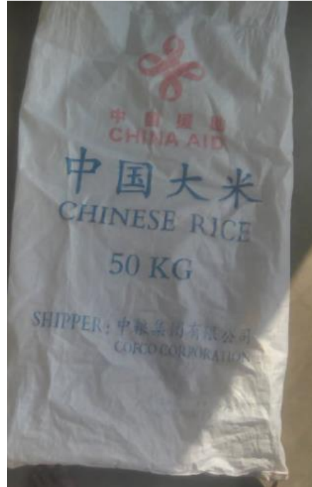
A sample of the 50kg bag of rice that was distributed during the by-election