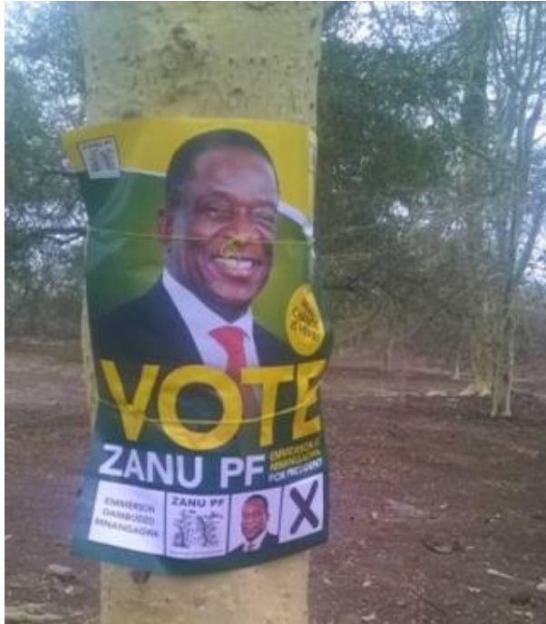
The ruling party campaign poster in use during the Chiredzi RDC Ward 12 by-election

posters, albeit the poster were of the president of the party and not the contesting candidate.