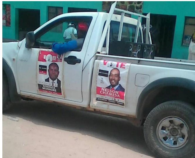
A Campaign Vehicle used by the MDC Alliance in Mutoko North Constituency

around Chitekwe and Kanyongo townships in a car playing loud music and pasting campaign posters on trees.