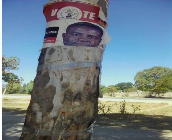
Torn Campaign Poster for the MDC Alliance Candidate

ZESN will continue to observe and report on developments and processes relating to the 24 November by-election in Mutoko North Constituency. The Network urges all political parties and their candidates and supporters to maintain a peaceful campaign environment and desist from committing any malpractices that may compromise the freeness, fairness, and credibility of the by-election.